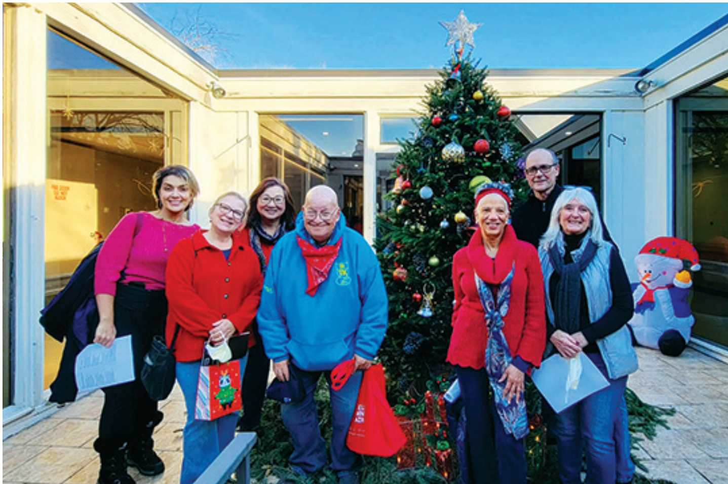
Christmas Caroling at Cedar Manor